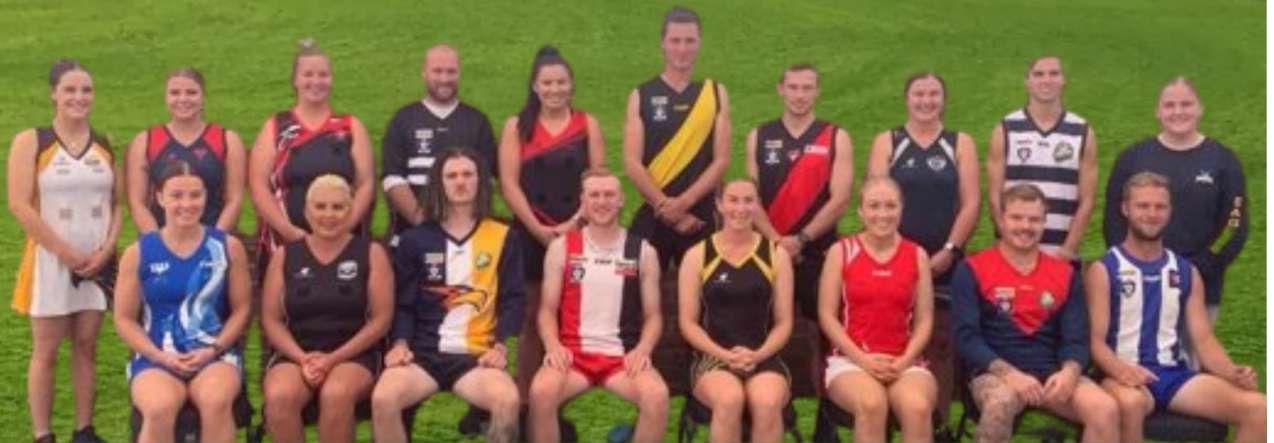
2022 CDFNL Senior Captains Photo